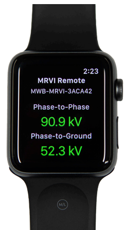
APPLE Watch® Display Available